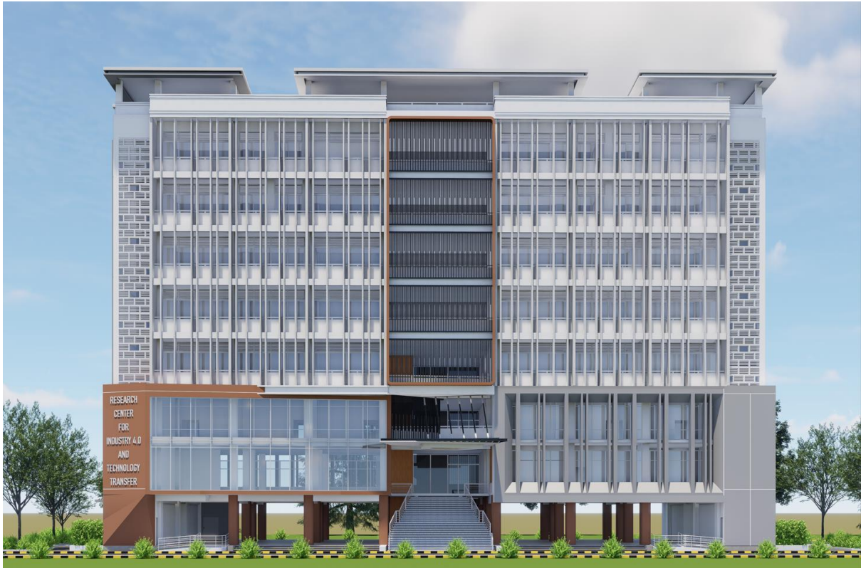
Figure 9: 8 th floor industrial 4.0 building (1)