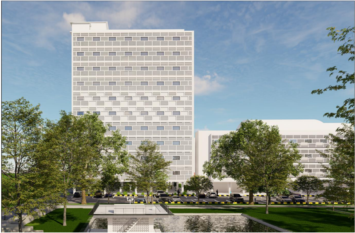
Figure 7: 11 th floor complex building at ITC main campus (1)