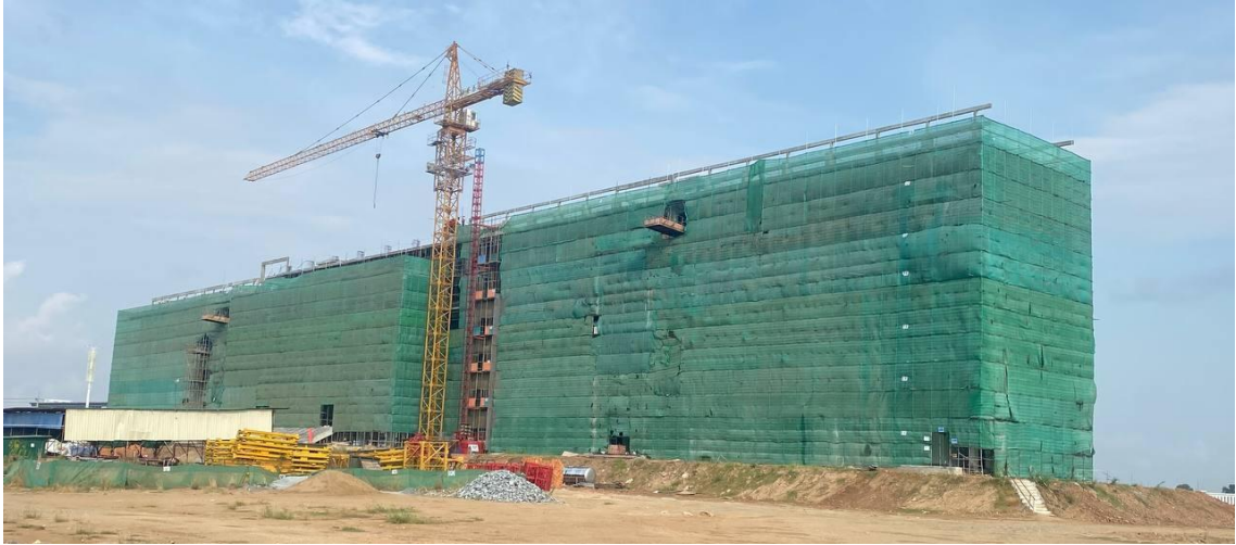
Figure 4: Research and Training Center under construction at ITC Win-Win Monument campus