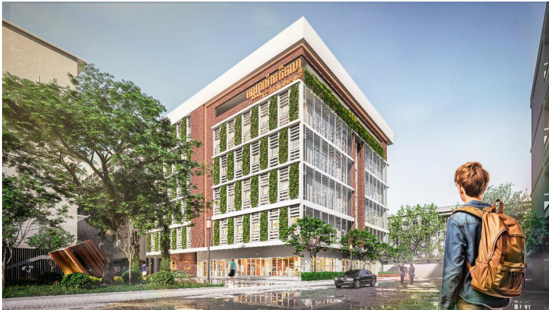
Figure 11: 6 th floor ITC new library building (1)

The new 6 th floor library (supported by 2 nd HEIP) was completed its design and the building will be constructed at ITC main campus from Q3 2026. The new library will serve as both physical and digital hub and also open access to public. The library will compose of admin office, open access area, private access area, book repairing room, computer rooms, symposium rooms, seminar rooms, multi-media room, and multi-purpose hall. The capacity of the library could accommodate up to 1,000 students and other staffs and public guests about 200 people.