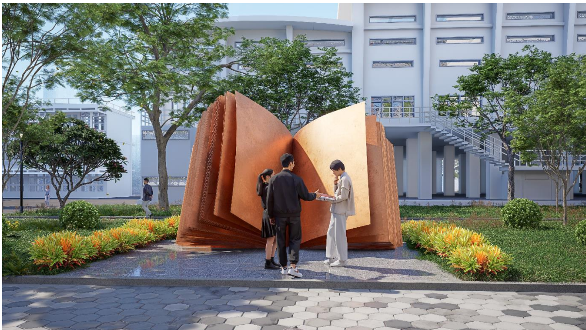
Figure 12: 6 th floor ITC new library building (2)