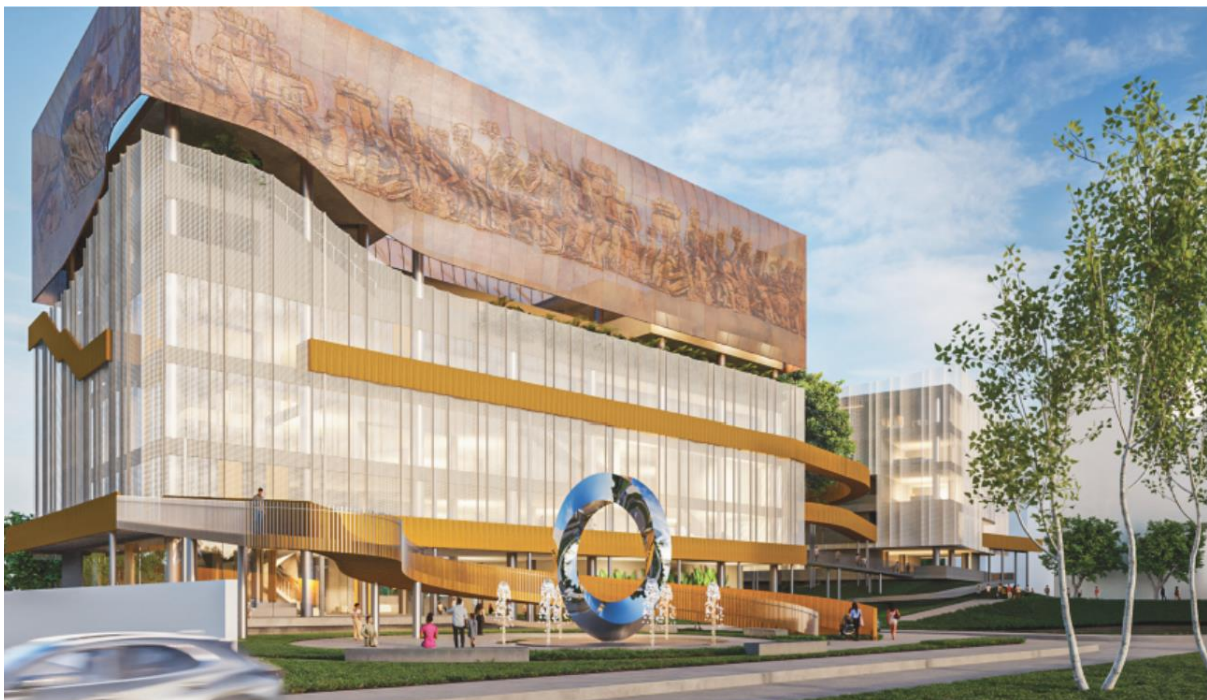
Figure 13: Cambodia Science and Technology Center building (Conceptual Design) (1)

The CSTC building is just completed conceptual design and the detail design is expected to start from June 2026. The construction of the center is planned to start in Q2 2027.