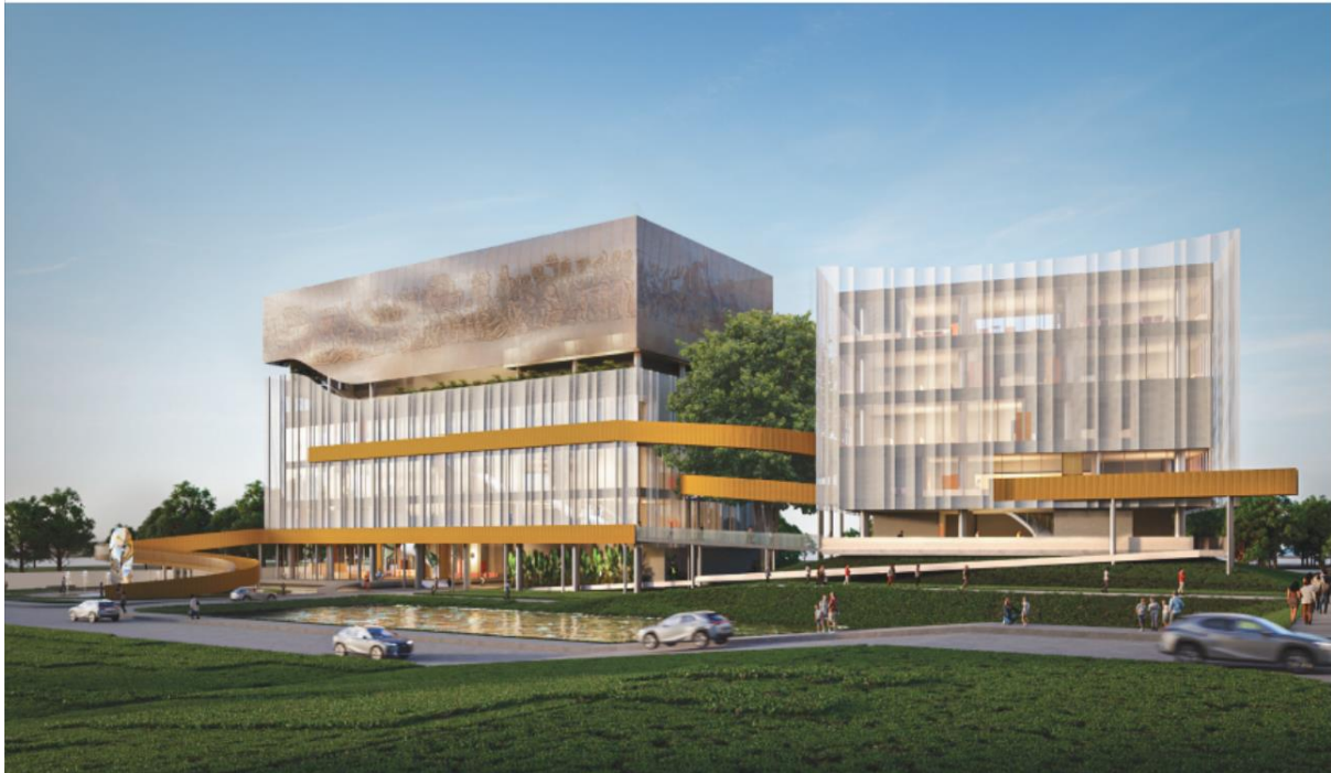
Figure 14: Cambodia Science and Technology Center building (Conceptual Design) (2)