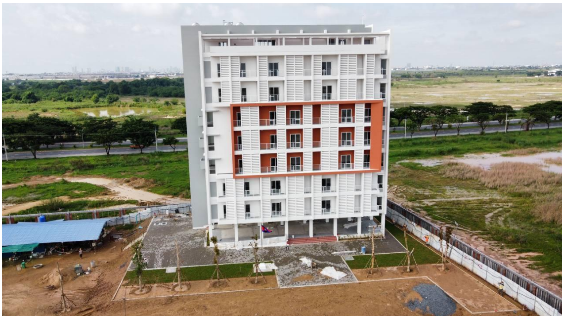
Figure 3: Student Dormitory at ITC Win-Win Monument campus