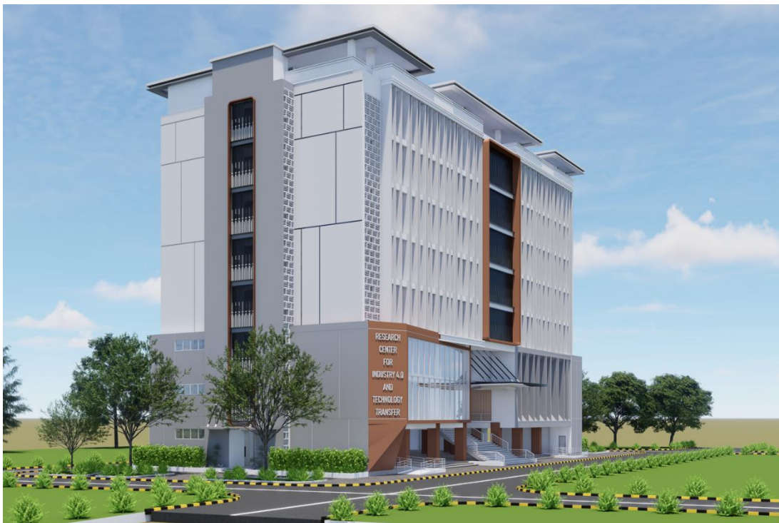
Figure 10: 8 th floor industrial 4.0 building (2)