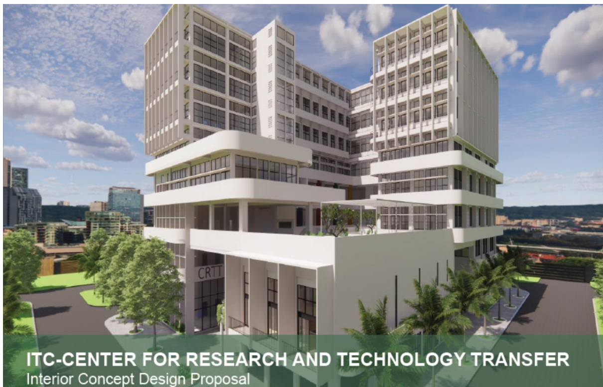
Figure 5: Architecture of Center for Research and Technology Transfer