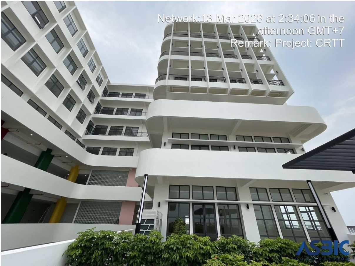
Figure 6: Center for Research and Technology Transfer under construction