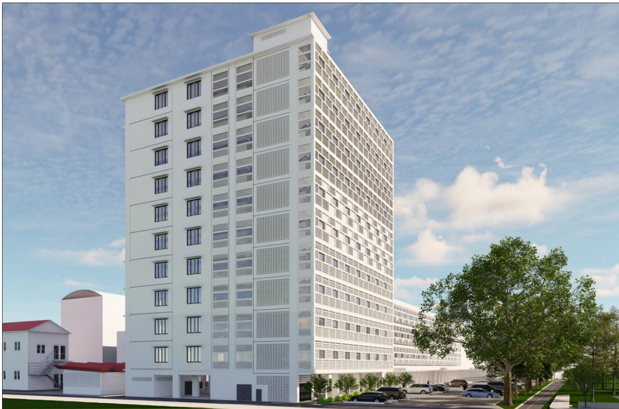
Figure 8: 11 th floor complex building at ITC main campus (2)